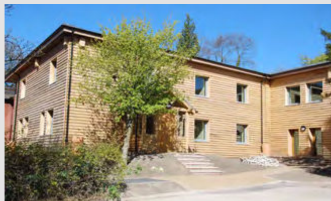
Figure 1 The refurbished 1960's former MOD accommodation (HMS Mercury in East Meon).

The current VAT rules are signalling that it is cheaper to demolish existing buildings, thereby releasing the embodied carbon, and to rebuild from scratch at 0% VAT. Government policies are effectively working against the refurbishment and retrofit agenda. It is time to remove this anomaly from the tax system and introduce zero rated VAT for all energy efficiency measures and domestic renewables to help kickstart the retrofit revolution and make our homes fit for the future.